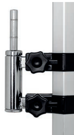
Flag Holder Set