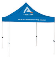
Tent with canopy