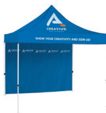
Tent with canopy and full wall