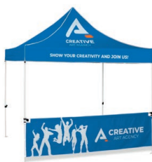
Tent with canopy and half wall