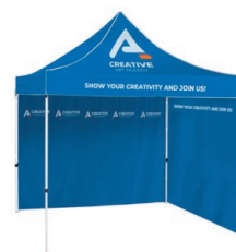
Tent with canopy and multiple walls