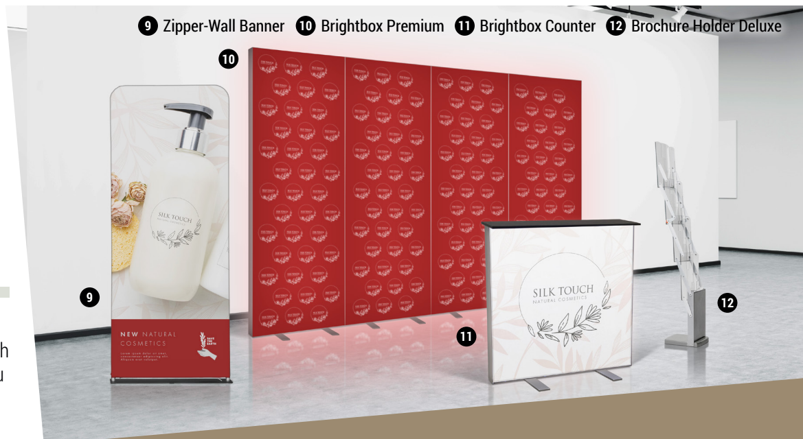
9 Zipper-Wall Banner 10 Brightbox Premium 11 Brightbox Counter 12 Brochure Holder Deluxe

Impress visitors with a Pop-Up Impress exhibition backwall. Complete your stand with a fabric Counter, a fabric Banner and a Brochure Holder.